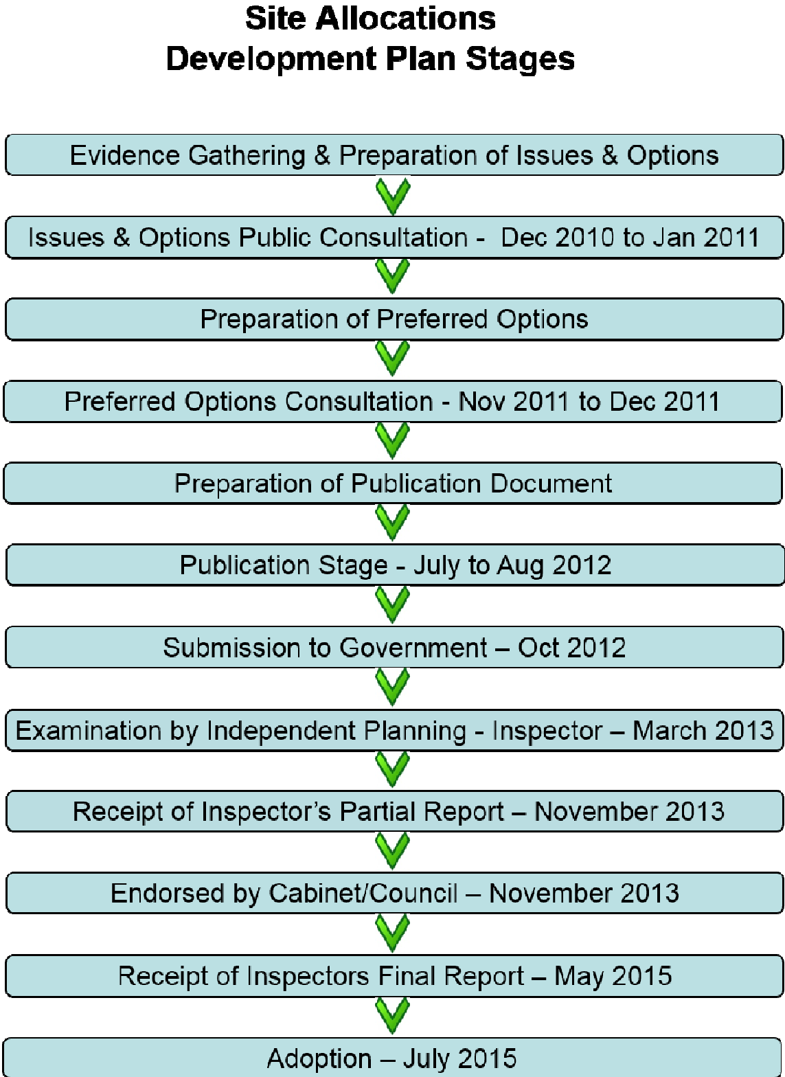
Figure 1 – Local Plan Document Stages

2.5 There are a number of stages involved in producing a Local Plan (see Figure 1).